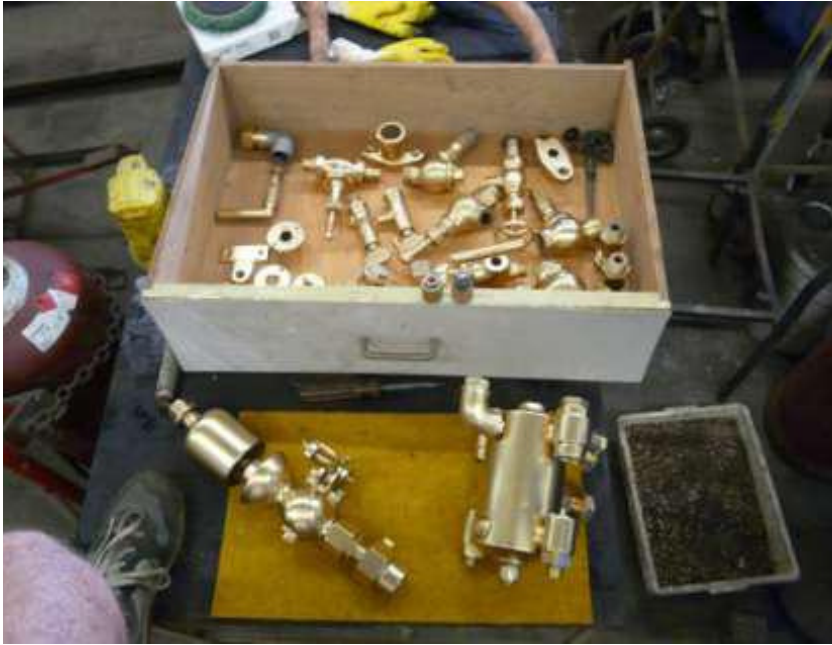
"Septone" Gold Chrome