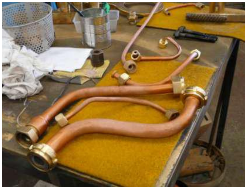
Copper Metal Spray