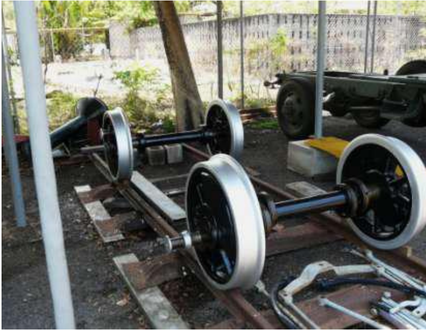
Ready for the Axle Boxes