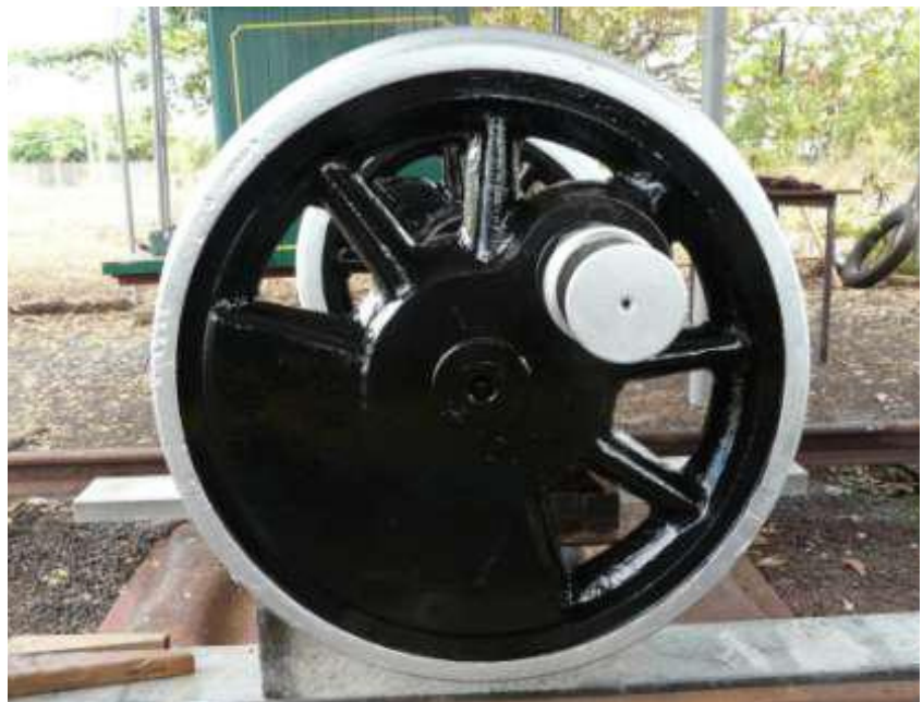
“POR15” Protective Coatings