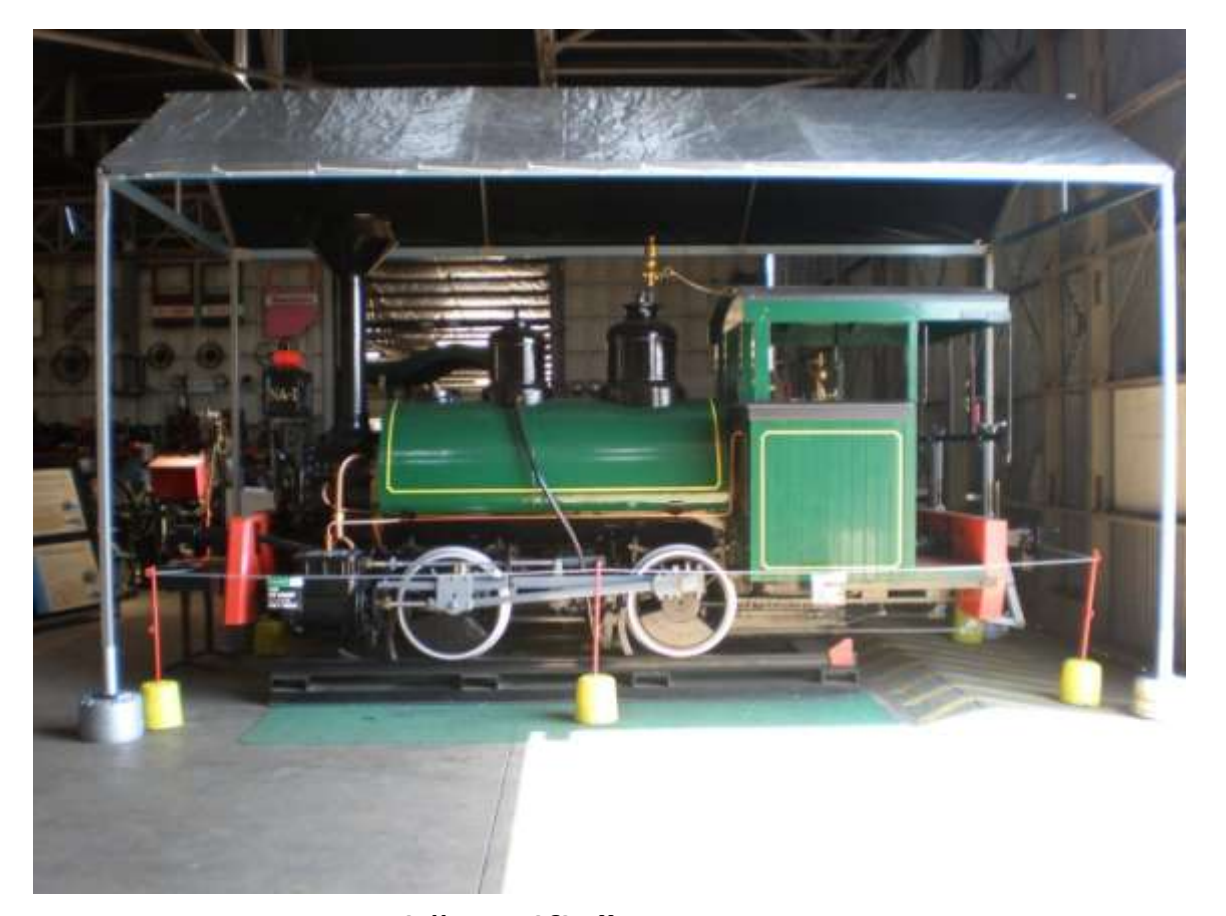
Heritage Listed "Sandfly" Locomotive Restoration Project – 2008/2009

Motor Vehicle Enthusiast's Club Incorporated Old Qantas Hangar, Parap, Darwin